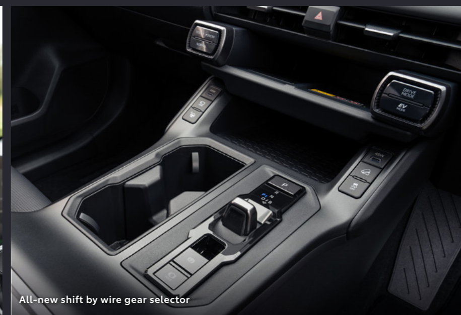
All-new shift by wire gear selector

For a more sophisticated, minimalist interior appearance, the 2.5 HEV VX and 2.5 PHEV** introduce a shift-by-wire turn-dial gear selector. The flagship PHEV** model, makes every journey ultra-comfortable thanks to power adjustable Sport seats and a keyless, foot activated boot.