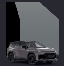
M38 Moon Grey Bi-Tone