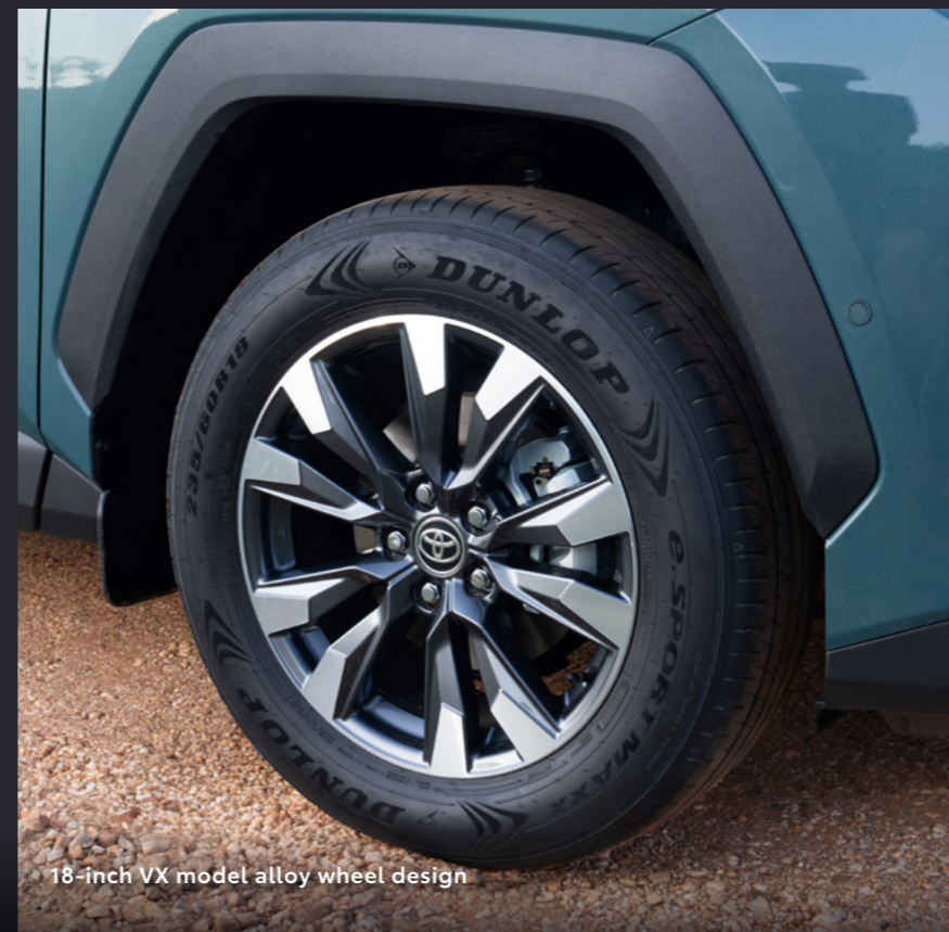
18-inch VX model alloy wheel design