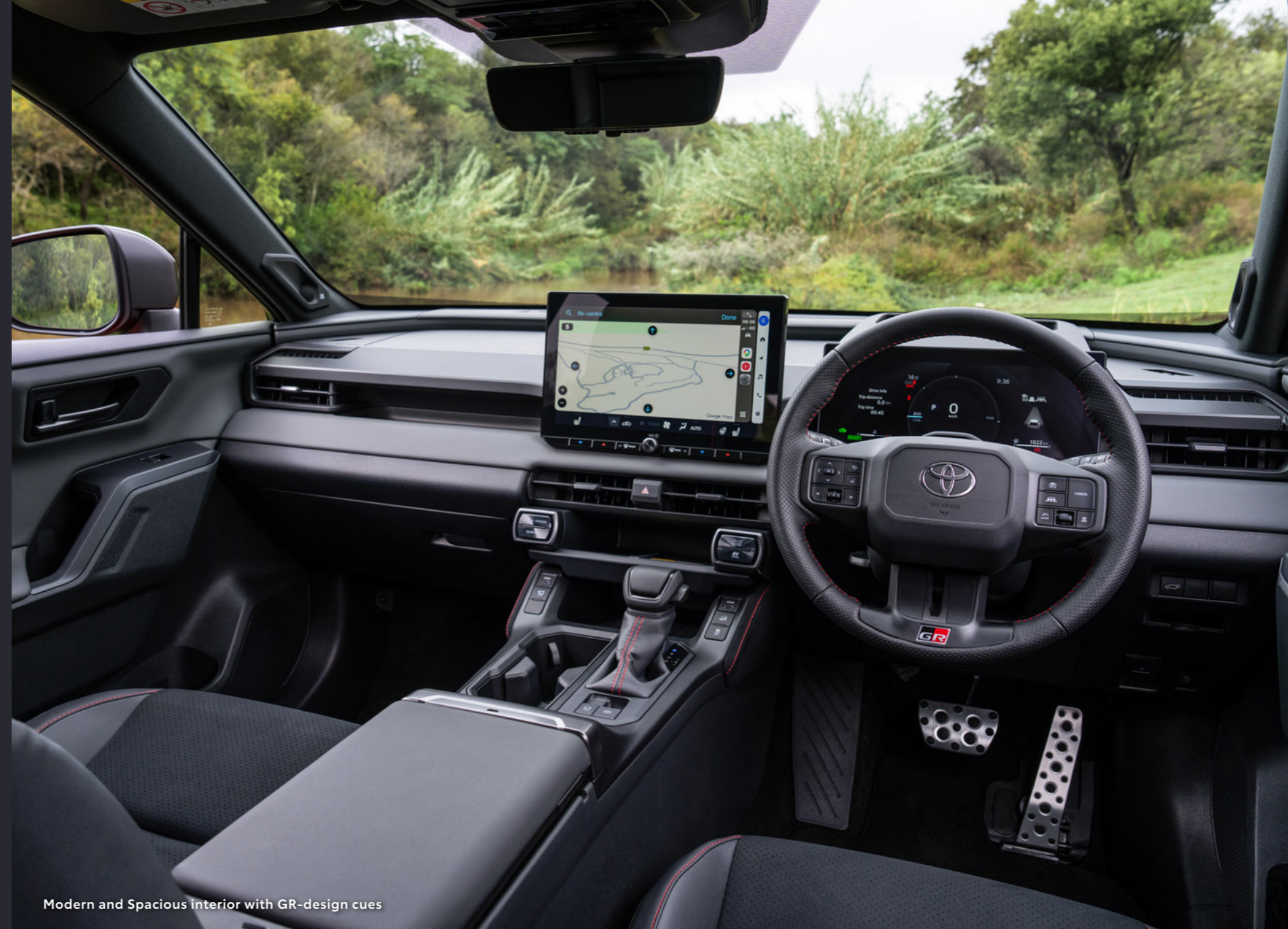
Modern and Spacious Interior with GR-design cues

Heated sports front seats are covered with Ultrasuede® and trimmed with red leather stitching, as are the gear selector and steering wheel (also heated) equipped with shift paddles for a more immersive yet luxurious drive.