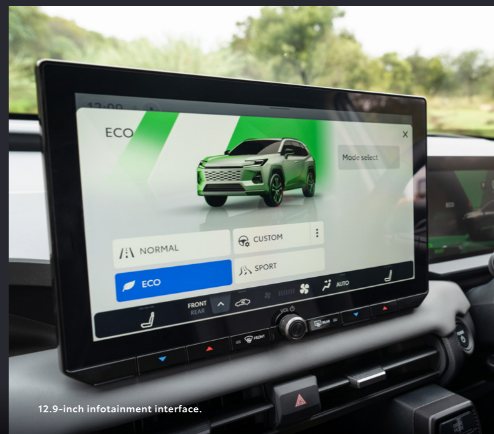
12.9-inch infotainment interface.