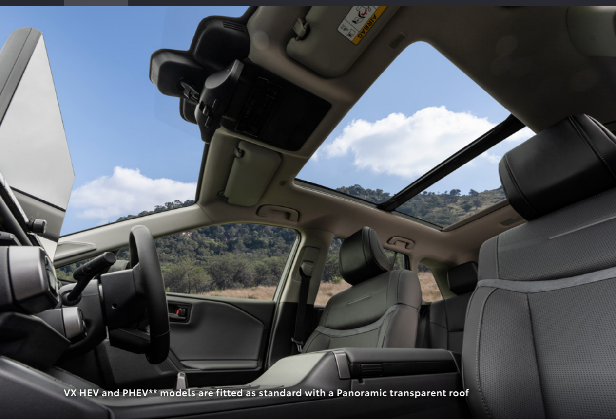
VX HEV and PHEV** models are fitted as standard with a Panoramic transparent roof

Comfort is of the essence with heated and ventilated* front and rear leather seats*, a leather-clad steering wheel*, automatically adjusting day/night rear view mirror, and a heads-up display*.