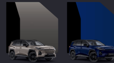
25Q Avant-Garde Bronze Bi-Tone M40 Moonlight Ocean Metallic Bi-Tone