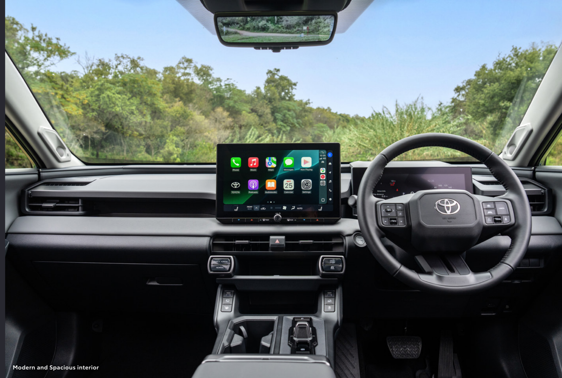
Modern and Spacious interior

*Available in selected models only. **PHEV coming soon.