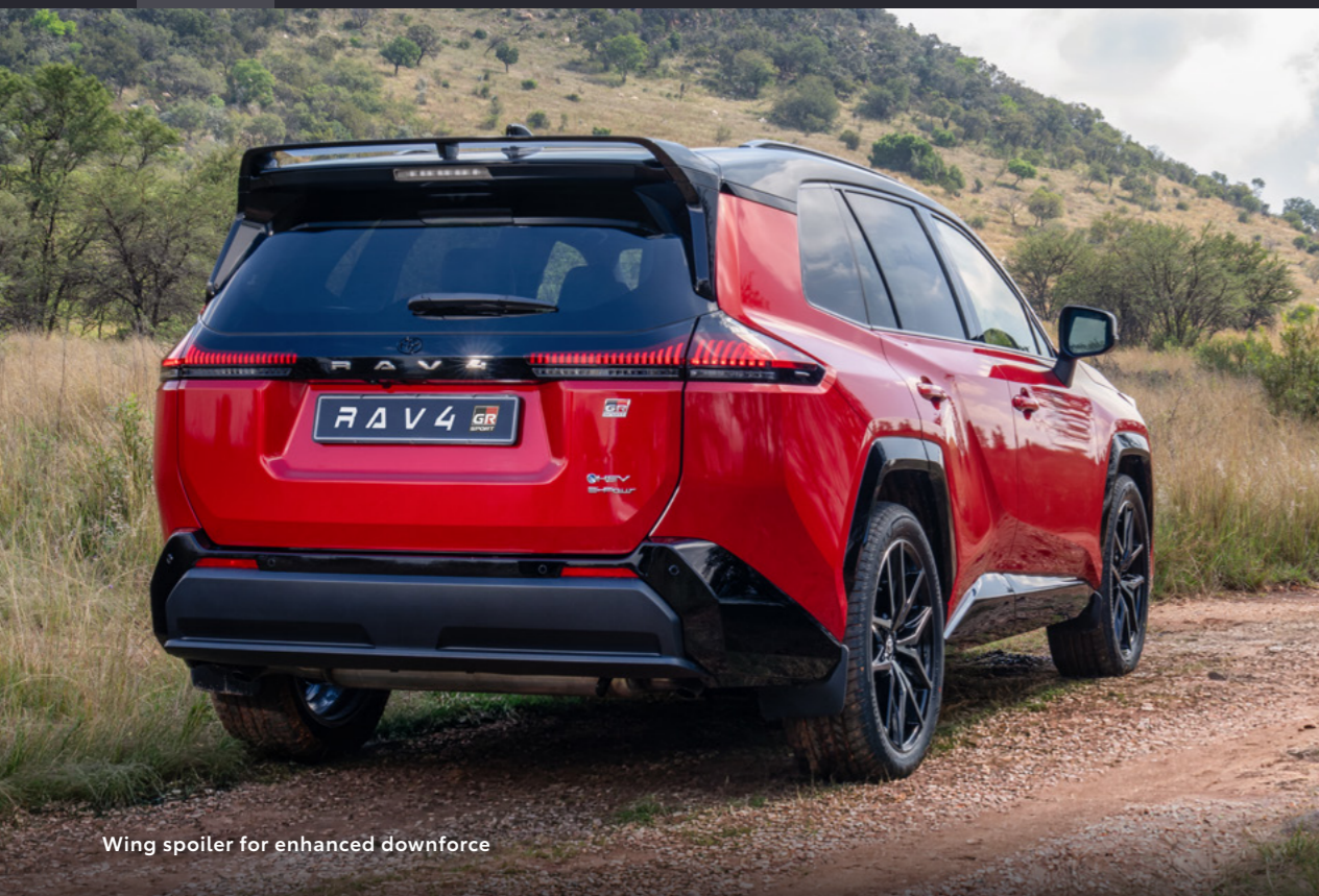
Wing spoiler for enhanced downforce