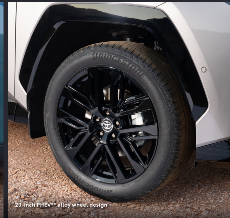
20-inch PHEV** alloy wheel design