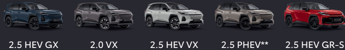
2.5 HEV GX 2.0 VX 2.5 HEV VX 2.5 PHEV** 2.5 HEV GR-S