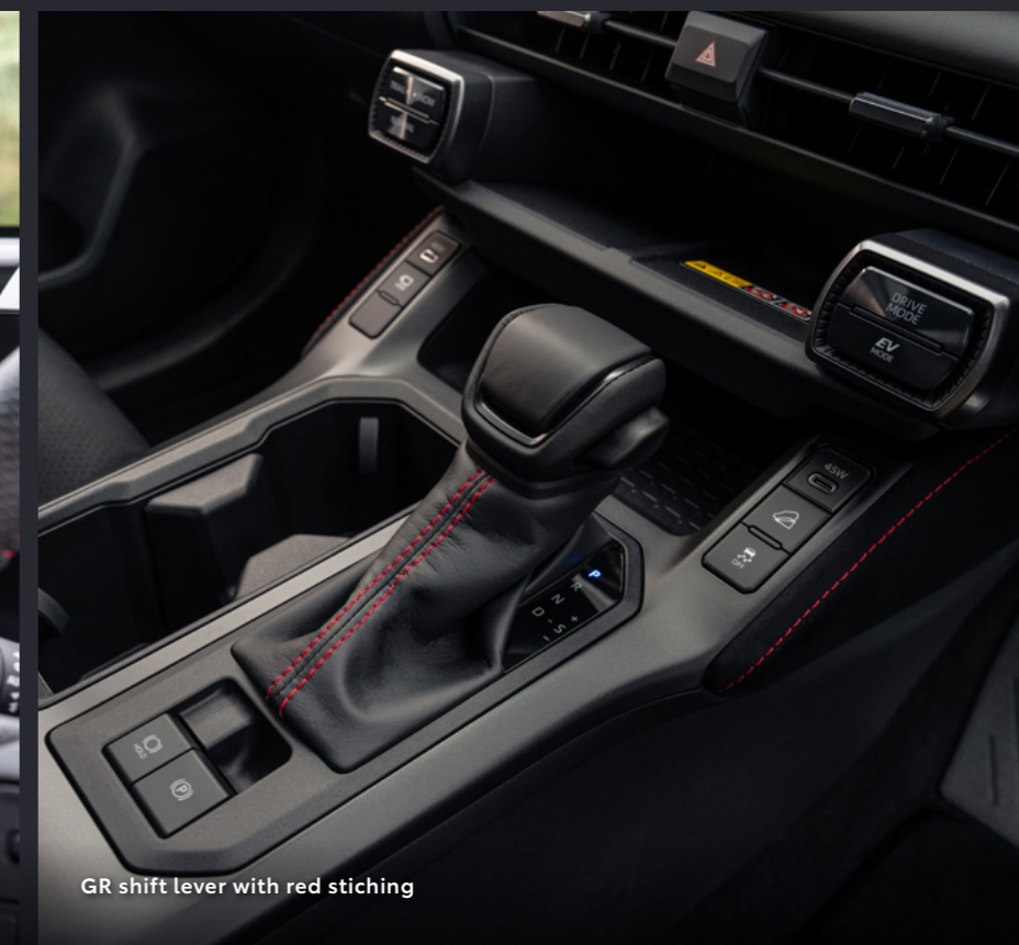
GR shift lever with red stitching