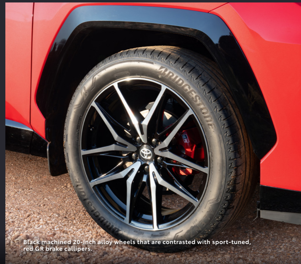
Black machined 20-inch alloy wheels that are contrasted with sport-tuned, red GR brake callipers.