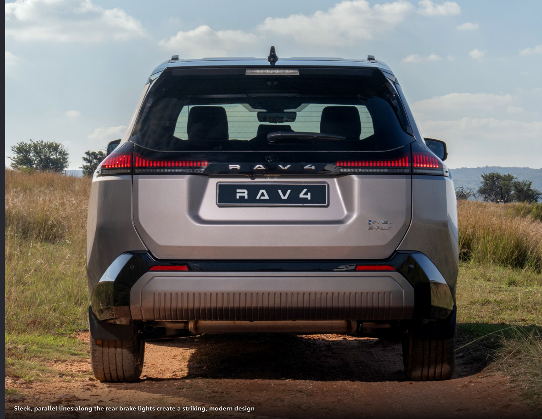
Sleek, parallel lines along the rear brake lights create a striking, modern design

Angular door lines enhance the RAV4's profile, and a bumper design that separates the brake lights create a distinctly futuristic look. GX and VX models sport striking 5-spoke, 18-inch alloy wheels while the flagship PHEV* features a more athletic 20-inch alloy wheel design.