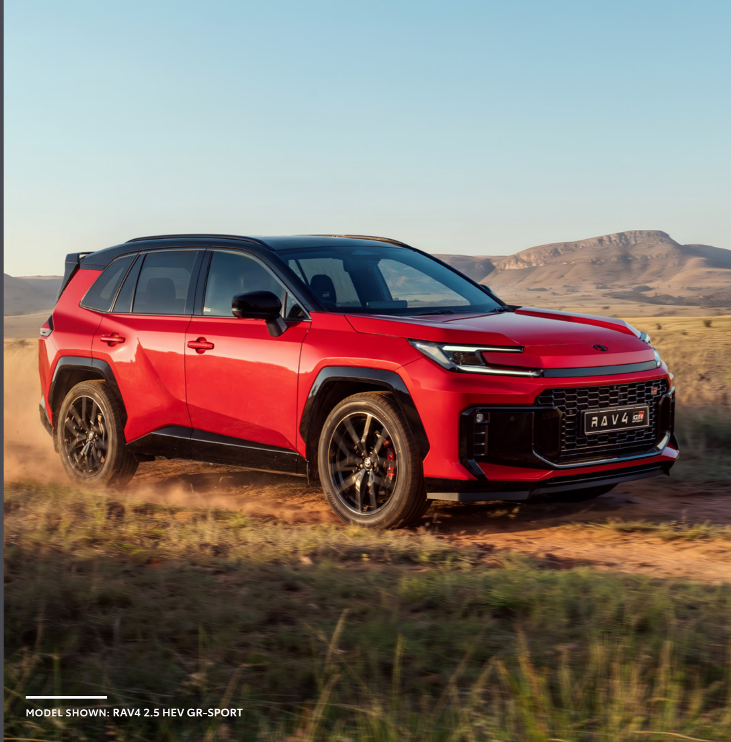
MODEL SHOWN: RAV4 2.5 HEV GR-SPORT