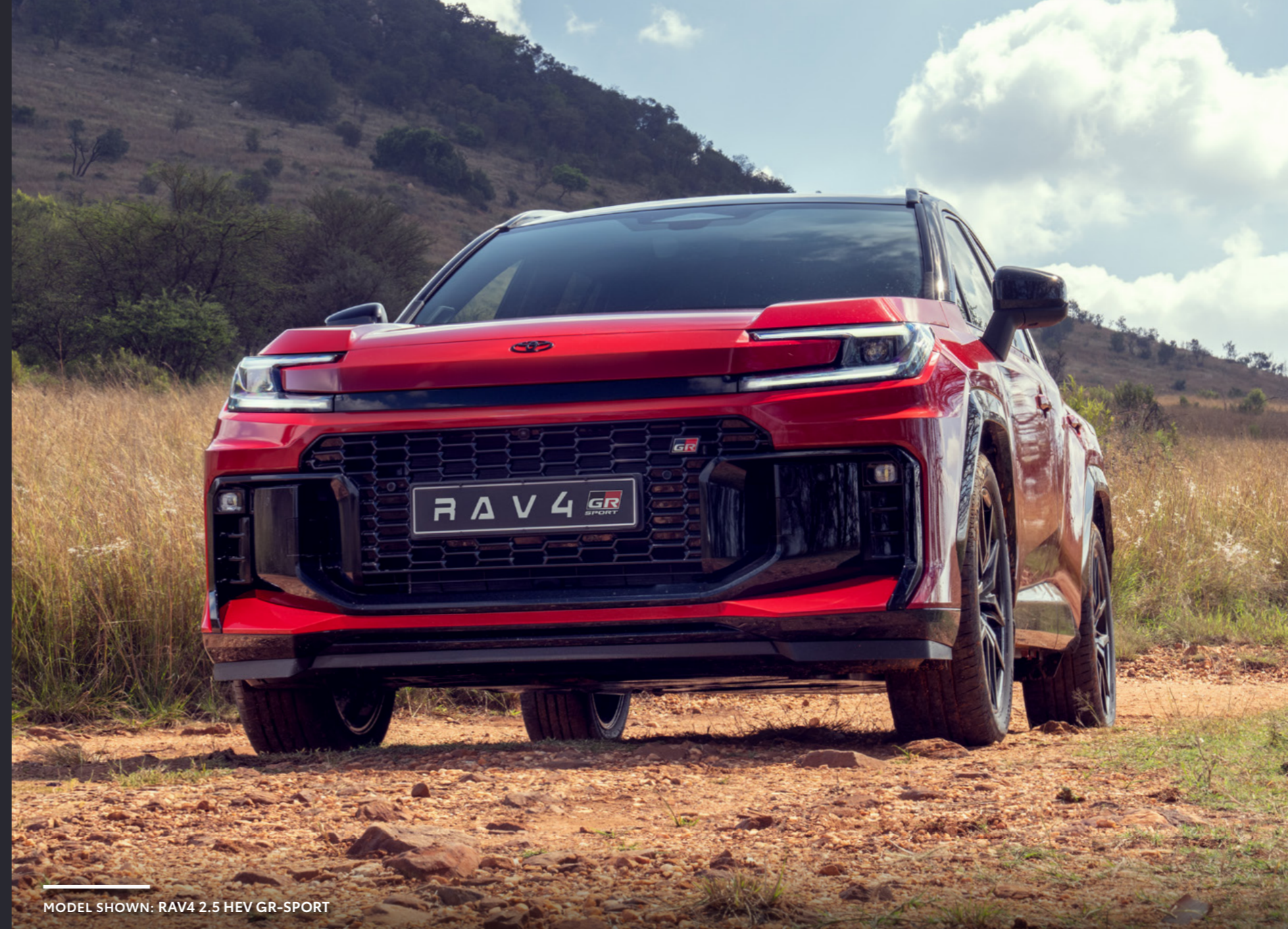
MODEL SHOWN: RAV4 2.5 HEV GR-SPORT

Choose from four bi-tone colours to match your adventurous spirit.