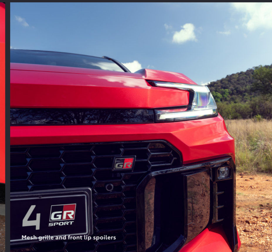
Mesh grille and front lip spoilers