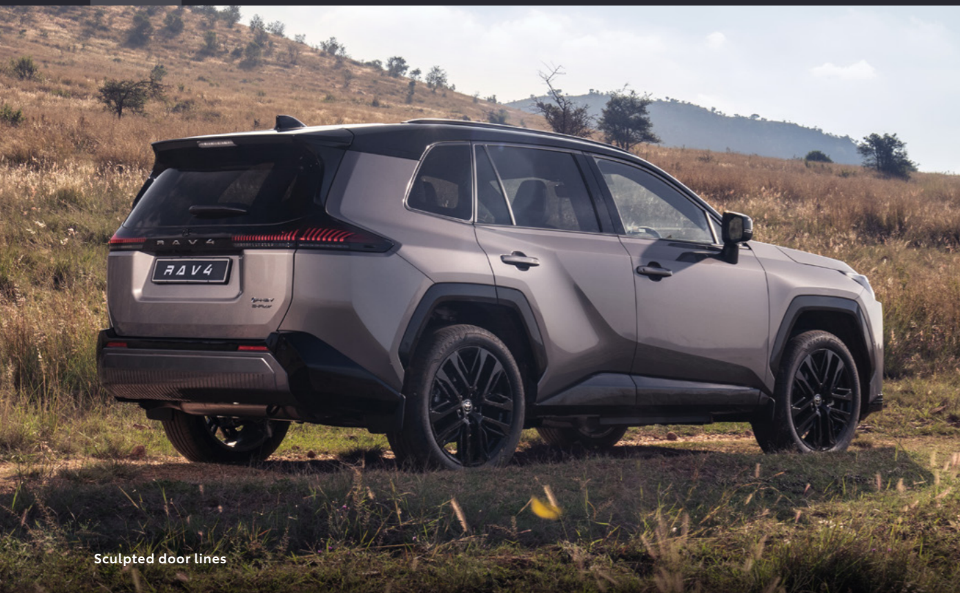
Sculpted door lines