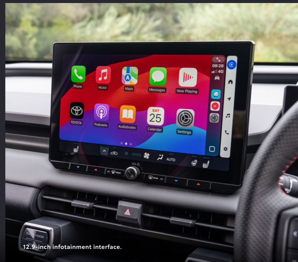
12.9-inch infotainment interface.