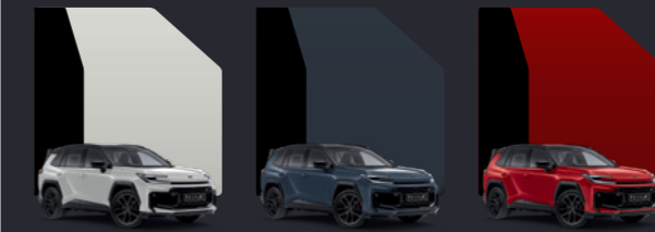
2VP Platinum White Bi-Tone M22 Smokey Blue Bi-Tone 2TB Passion Red Bi-Tone