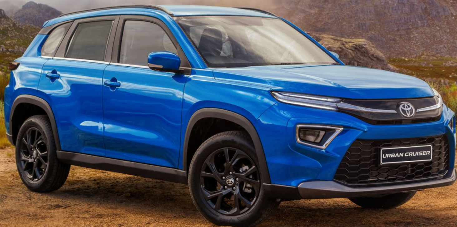
MODEL SHOWN: URBAN CRUISER 1.5 XR AUTOMATIC