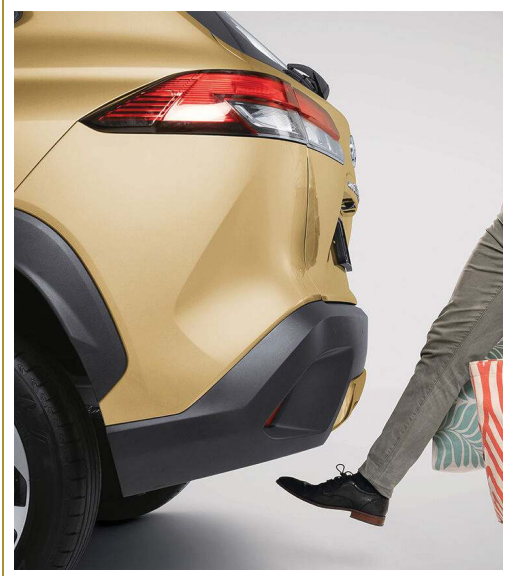
Wave your foot under the rear bumper, and it opens like magic.

The power rear door, available on the Xr and GR-S models, is a game-changer. With a simple kick under the rear bumper, the motorised tailgate opens smoothly, making loading and unloading easier than ever. It's a feature you don't realise you need until you have it.