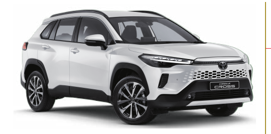
Toyota's Corolla Cross facelift, to be revealed earlier this year, brings a redesigned grille and updated interior.

When a car like the Toyota Corolla Cross gets a facelift, it's not just about looks—it's about refining what already works and adding a touch of brilliance. The 2025 model does exactly that. Toyota's latest updates strike the perfect balance between practicality and a hint of luxury, making it a vehicle that's both a workhorse and a showstopper.