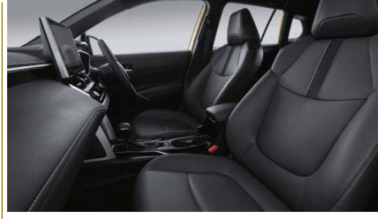
Inside, it's all about refinement: Inviting and undeniably premium.