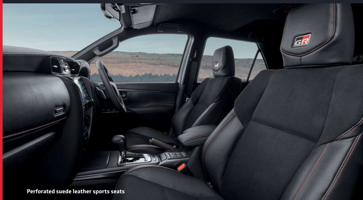
Perforated suede leather sports seats