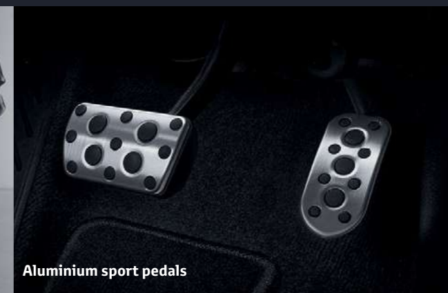
Aluminium sport pedals