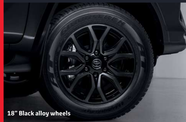
18" Black alloy wheels

Even when you're out roughing it, you're sure to be styling in the Fortuner GR-Sport.