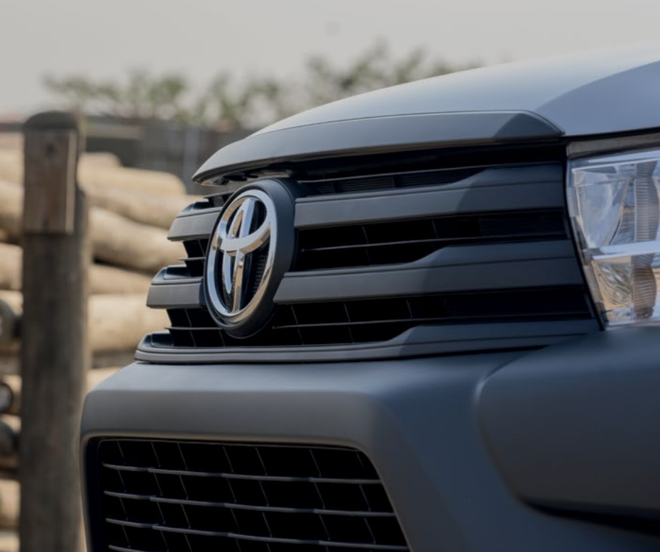
BLACK FRONT BUMPER*