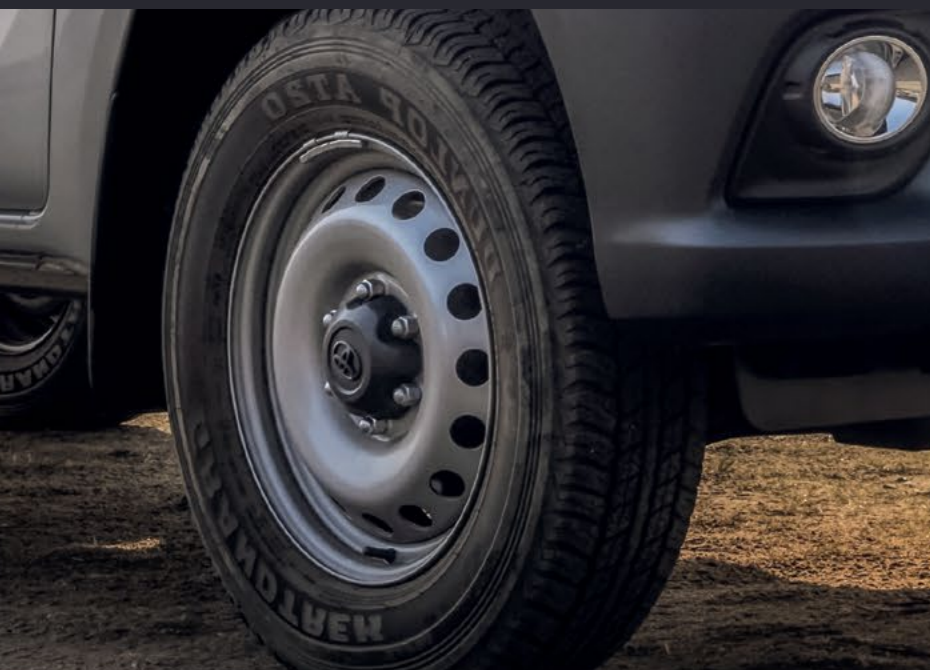
17" STEEL WHEELS*