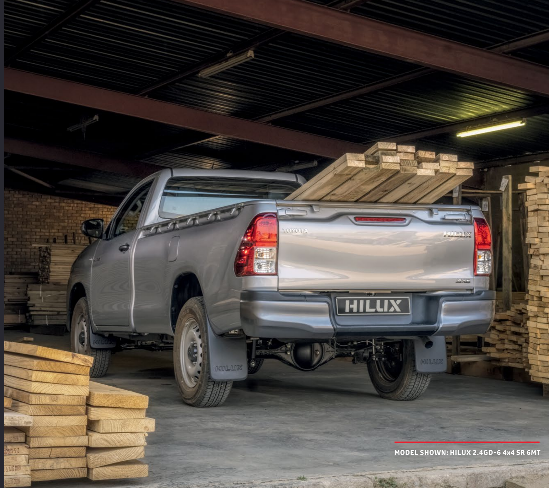
MODEL SHOWN: HILUX 2.4GD-6 4x4 SR 6MT

The upgraded styling on the Raider includes improvements to the engine hood, front bumper, lower guard and bumper corners supporting the protruding grille. The front bumper is colour-coded with a prominent horizontal axis extending across the headlamps and upper grille. And the front trapezoidal, thick frame grille is now a tougher-looking and enviable chrome and black.