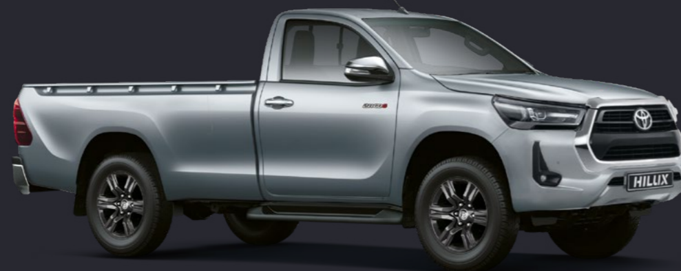
MODEL SHOWN: Hilux 2.8 GD-6 Raised Body Raider 6AT

NOTHING SHOUTS "BRING IT ON" LIKE A BOLDLY STYLED BAKKIE. BRINGING OUT THE BEST IN THE NEW MODELS – AND YOU – IS AN AGGRESSIVE EXTERIOR PACKAGE THAT CHALLENGES THE STATUS QUO.