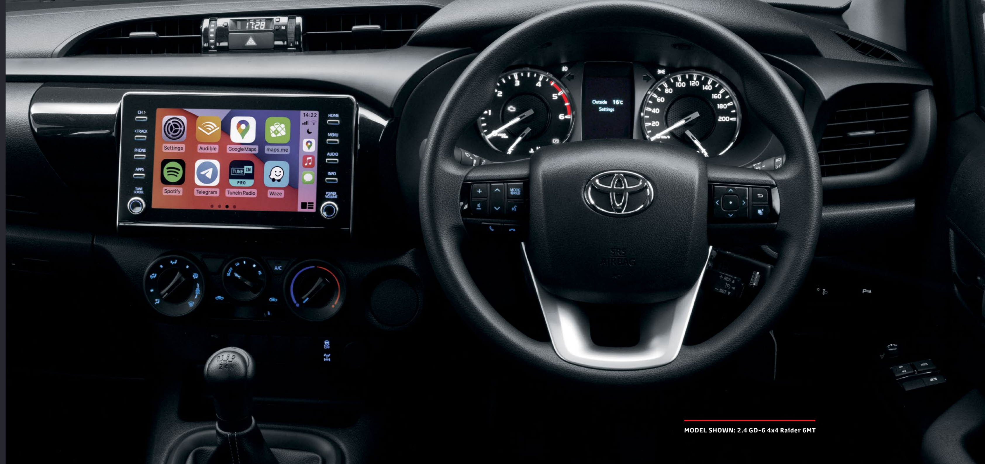
MODEL SHOWN: 2.4 GD-6 4x4 Raider 6MT

See the inside back cover for more information.