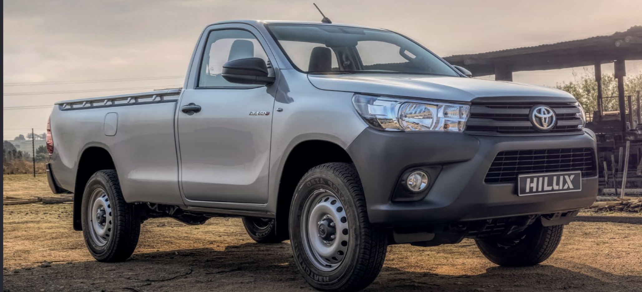
MODEL SHOWN: HILUX 2.4GD-6 4x4 SR 6MT

THE HILUX SINGLE CAB WORKHORSE IS THE VERY DEFINITION OF "NEVER SAY DIE". A TRUE EMBODIMENT OF THE LEGENDARY TOUGHNESS YOU'VE COME TO EXPECT FROM A BAKKIE WEARING A HILUX BADGE. NOW MORE THAN EVER YOU NEED WHAT IT TAKES TO GET THE JOB DONE, AND YOU NEED A PARTNER YOU CAN RELY ON NO MATTER HOW DIFFICULT THE TASK. WITH A HILUX WORKHORSE BY YOUR SIDE YOU CAN GO OUT THERE, GET YOUR HANDS DIRTY AND SHOW THEM WHAT YOU'RE MADE OF. DISCOVER A WORLD WHERE YOU CAN TAKE BOTH THE GOOD AND THE BAD IN YOUR STRIDE AS YOU DISCOVER HOW TOUGHNESS AND CONQUERING ANY CHALLENGE IS JUST A WAY OF LIFE WITH THIS BEAST OF BURDEN.