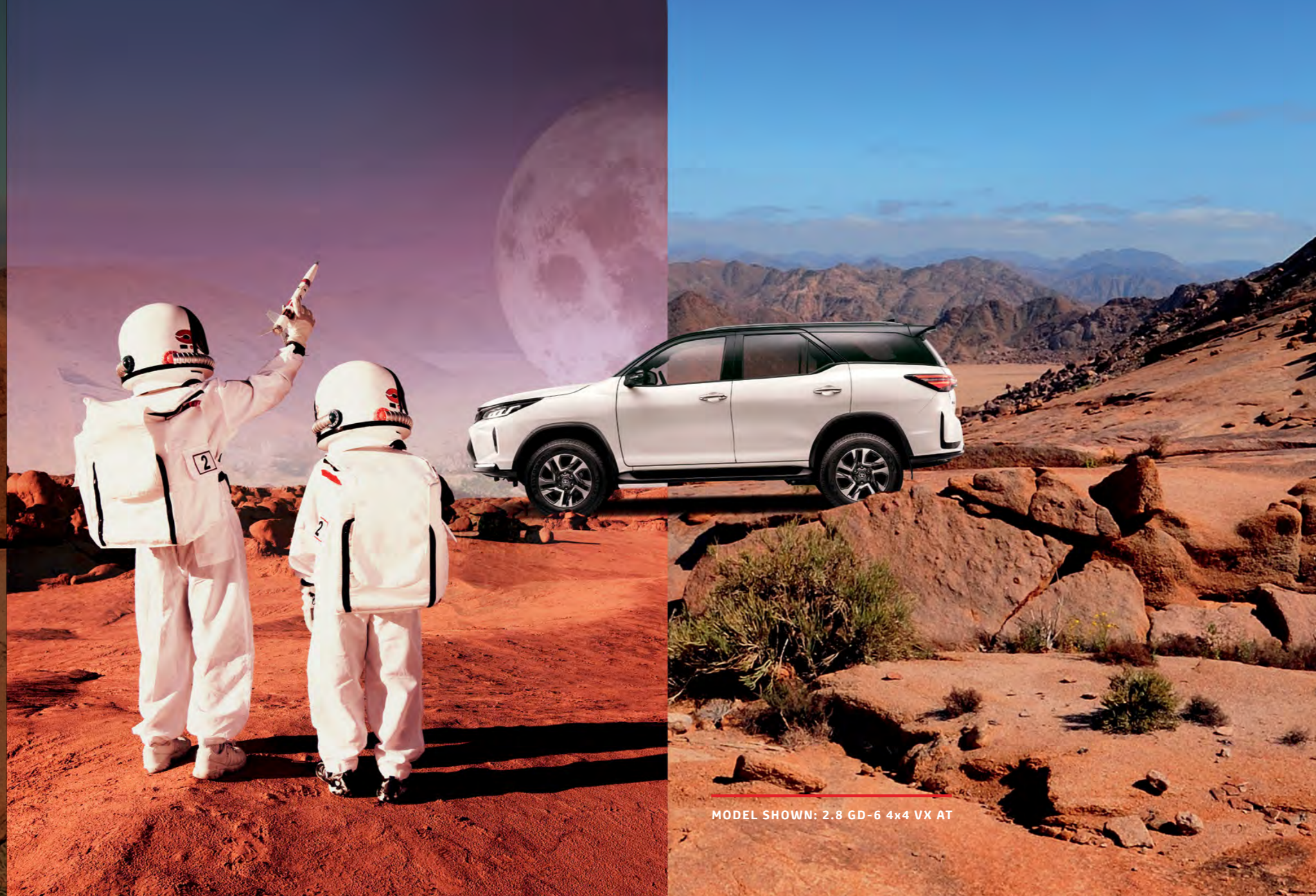
MODEL SHOWN: 2.8 GD-6 4x4 VX AT

TRUE FREEDOM IS KNOWING YOUR LOVED ONES ARE SAFE AND SECURE. THAT'S WHY IN THE NEW FORTUNER, PEACE OF MIND COMES STANDARD. GO FEARLESSLY WITH ADVANCED SECURITY TECHNOLOGY THAT INCLUDES SMART ENTRY, WIRELESS DOOR LOCKING, AN INTRUSION SENSOR, AN INDEPENDENTLY POWERED ALARM, IMMOBILIZER AND ULTRASONIC GLASS BREAKING SENSOR. PLUS – AT CERTAIN SPEEDS, YOUR DOORS WILL AUTOMATICALLY LOCK UPON PULL-AWAY.