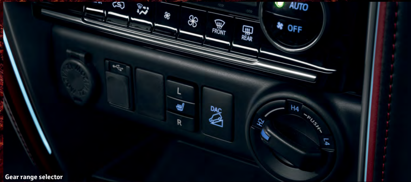
Gear range selector