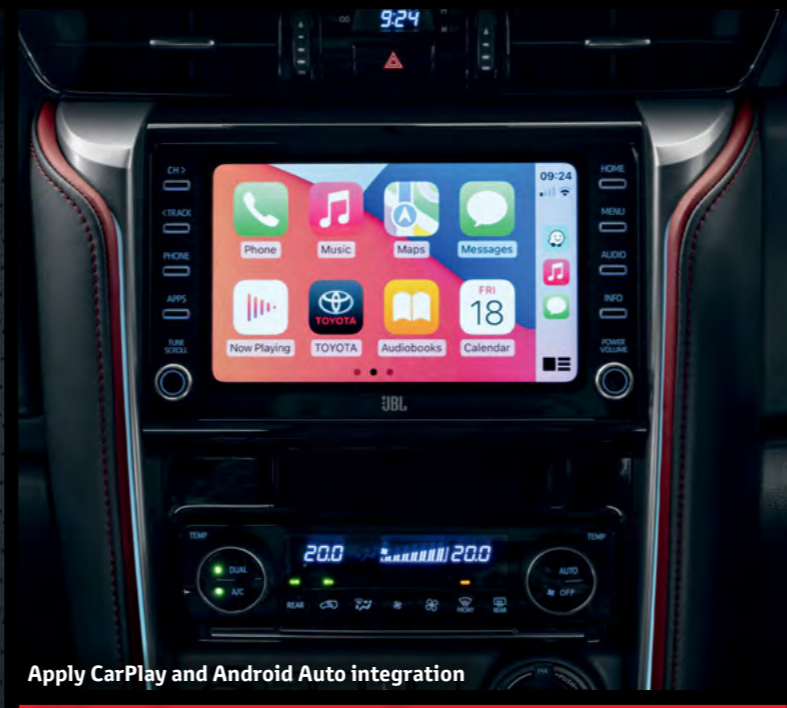
Apply CarPlay and Android Auto integration