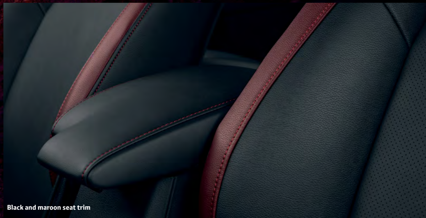
Black and maroon seat trim