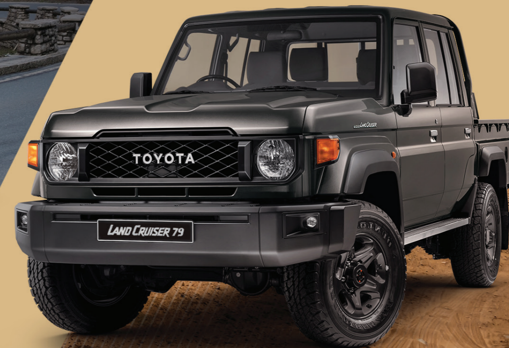
MODEL SHOWN: Land Cruiser 79 2.8 Double Cab AT Diesel