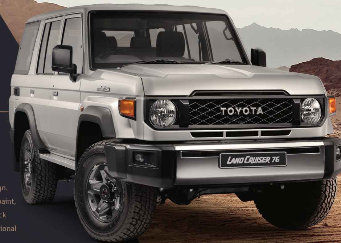
MODEL SHOWN: Land Cruiser 76 2.8 GD-6 SW LX Diesel