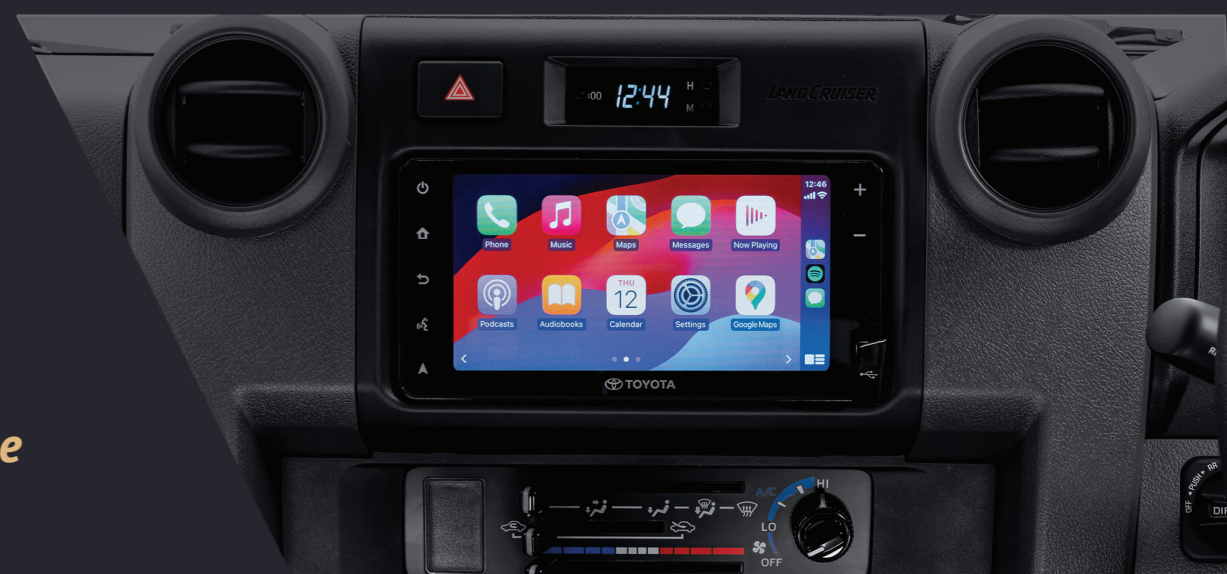
Touch-screen infotainment system

The Land Cruiser 70 Series' interior maintains its classic style while adding convenience to match the modern world.