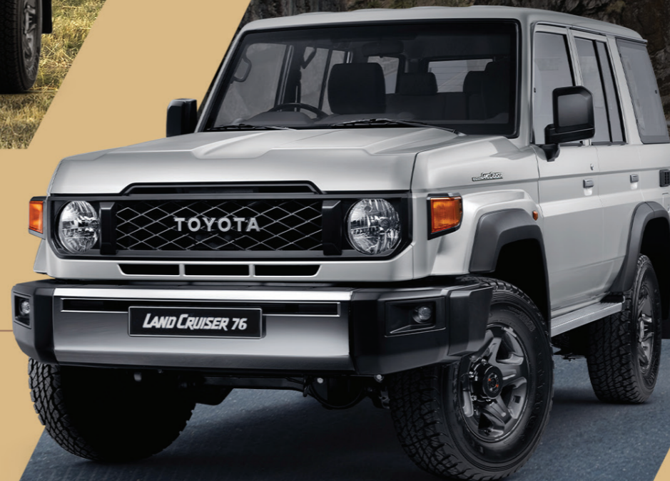
MODEL SHOWN: Land Cruiser 76 2.8 GD-6 SW LX Diesel