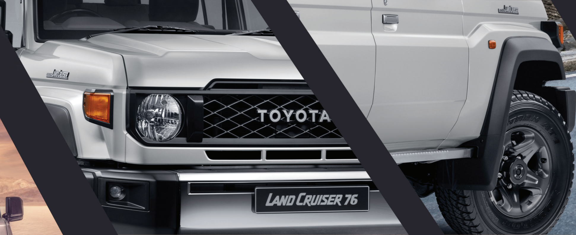
Rugged grille with plated bumper