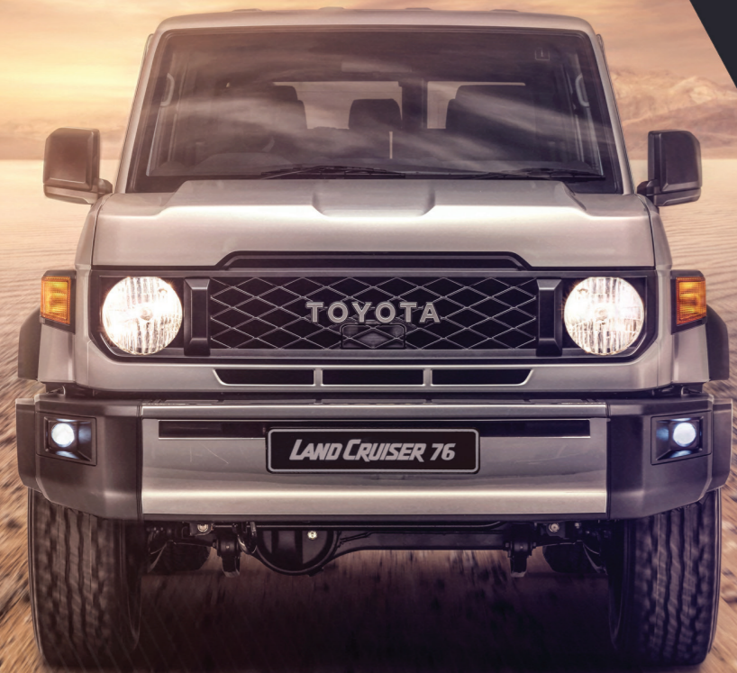
MODELS SHOWN: Land Cruiser 76 2.8 GD-6 SW LX Diesel