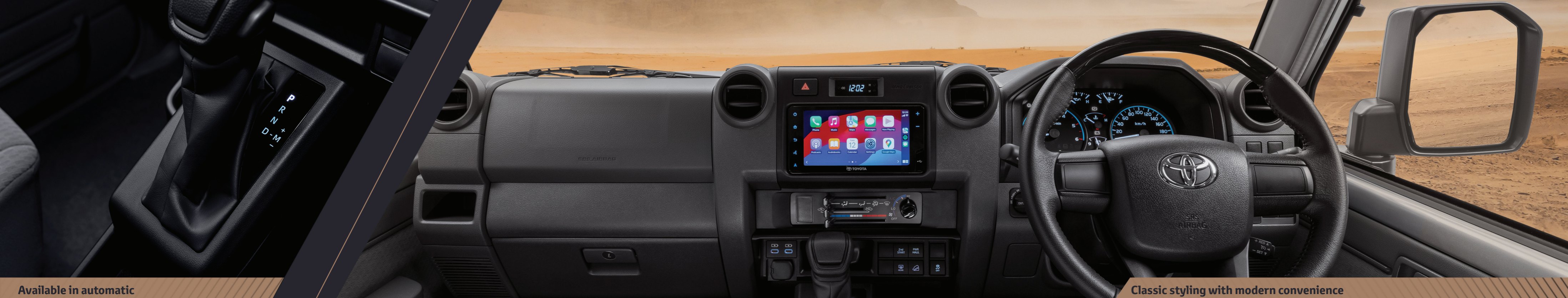
Available in automatic