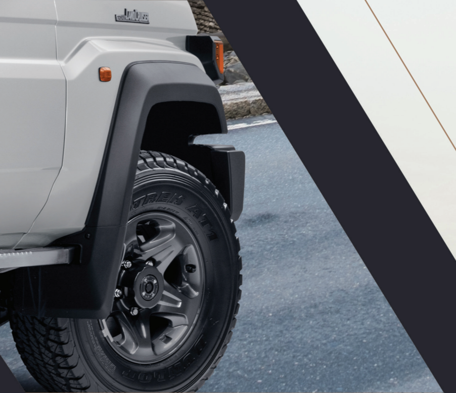
16" aluminium wheels