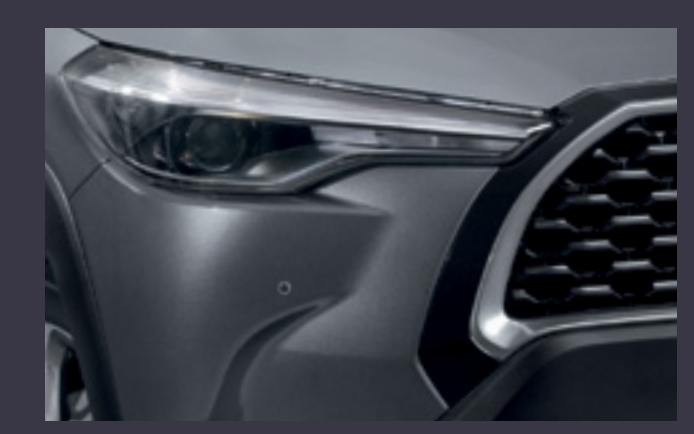
DISTINCTIVE LED* HEADLAMPS

At the rear, large elliptical taillamps with trapezoidal detailing and crease lines provide a sleek and sophisticated look, flanking the rear door that has been designed for optimal ease of accessibility. The result is a vehicle that provides an uncompromised cross between form and functionality.