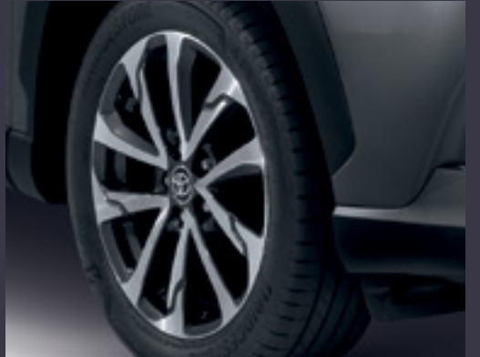
18"* ALLOY WHEELS