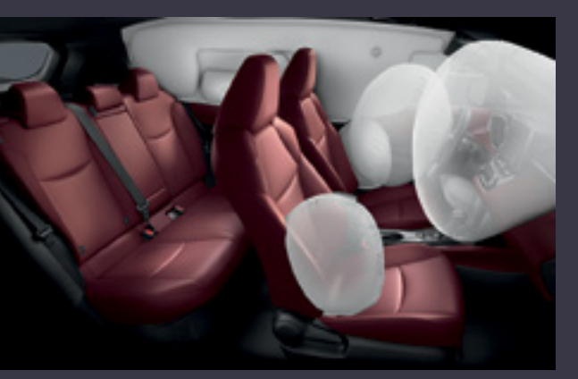
*Available on selected models

To keep occupants safe in the event of a collision, the Corolla Cross is equipped with up to seven airbags, distributed as driver, front passenger, driver-knee, front side and curtain* airbags.