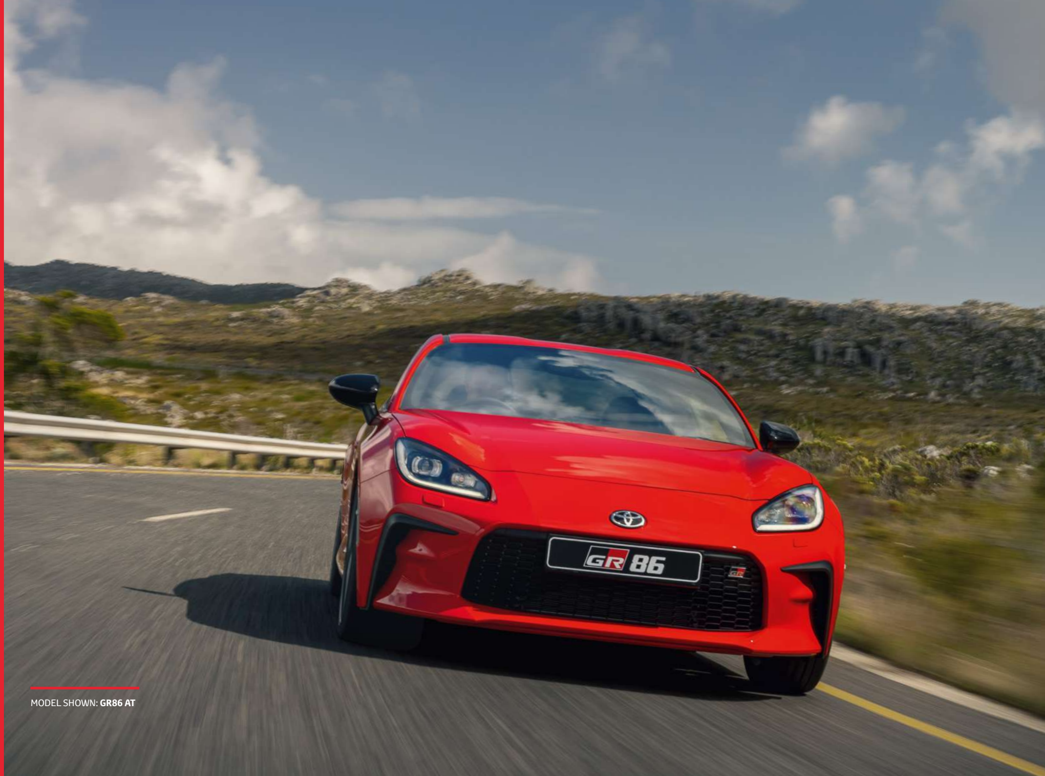
MODEL SHOWN: GR86 AT