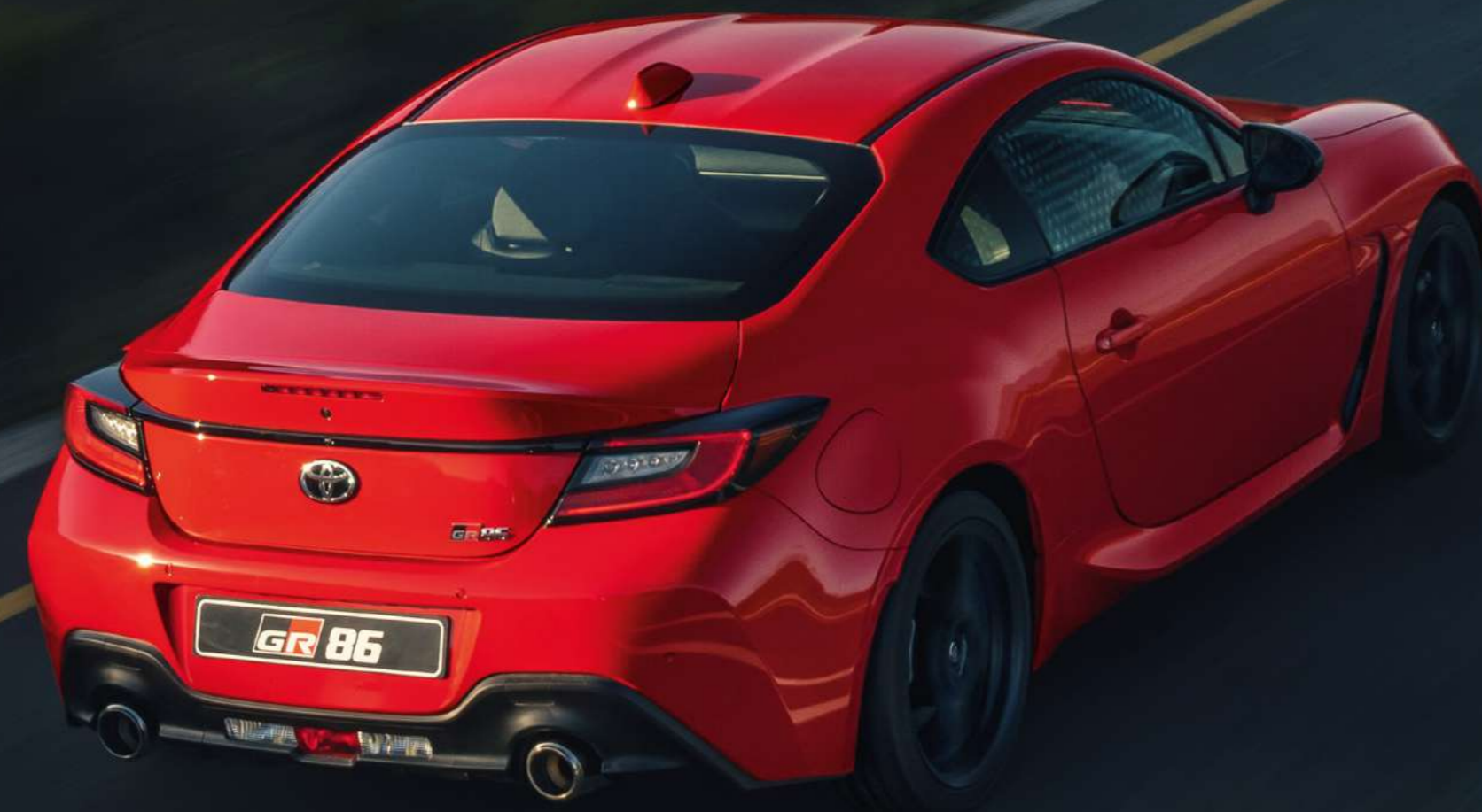
MODEL SHOWN: GR86 AT