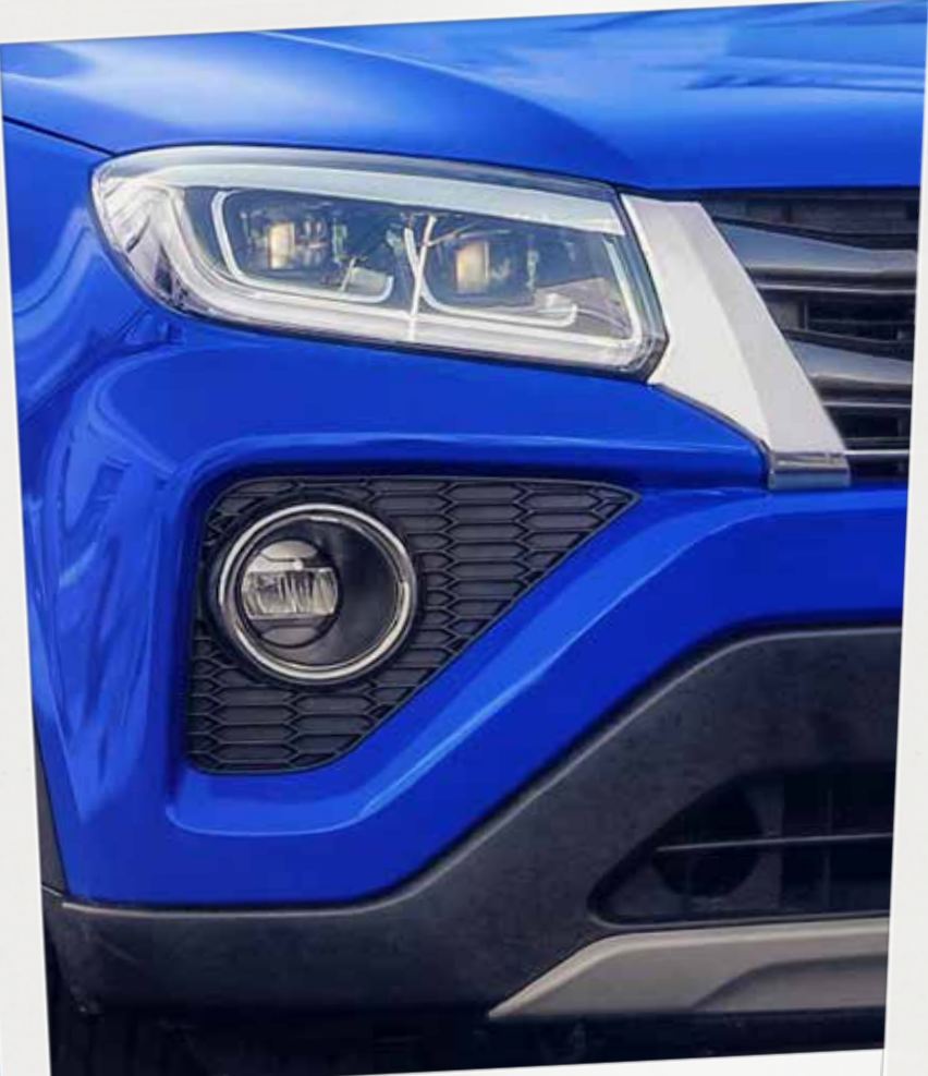
LED front fog lamps*