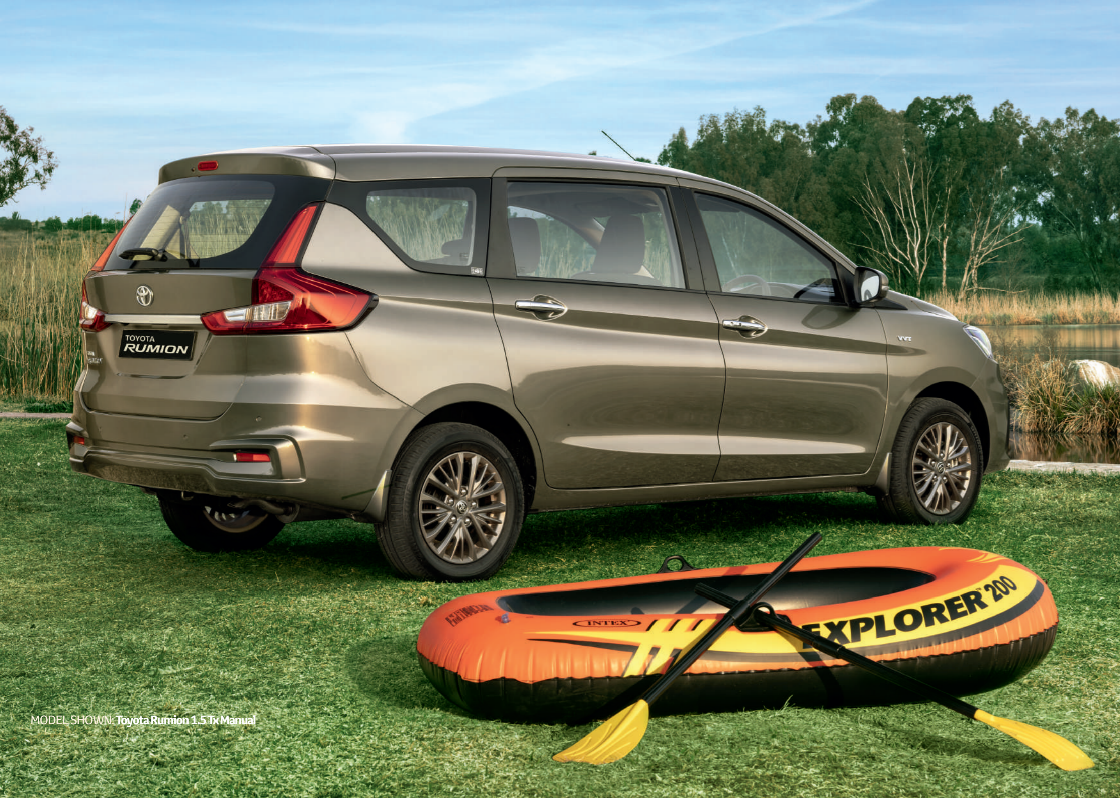
MODEL SHOWN: Toyota Rumion 1.5 Tx Manual