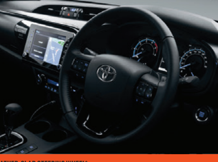
LEATHER-CLAD STEERING WHEEL*

Occupants of Legend RS and 4.0 l V6 models enjoy leather seats (of which the driver seat is electrically adjustable) with perforation for better breathing, a leather-clad gear selector and steering wheel. The Legend models comes standard with Legend fabric seats.