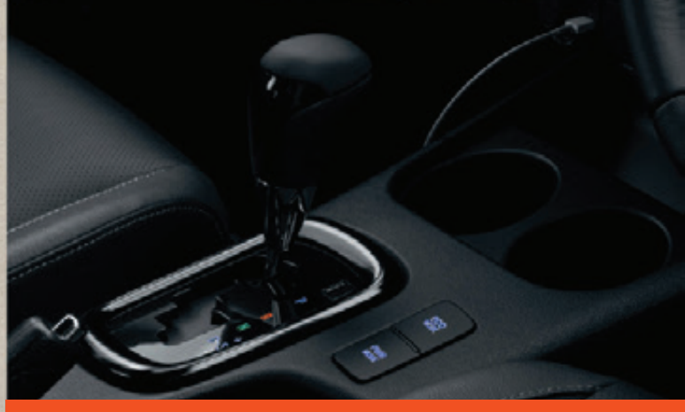
EATHER-CLAD GEAR SELECTOR*