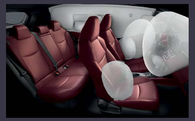
*Available on selected models

To keep occupants safe in the event of a collision, the Corolla Cross is equipped with up to seven airbags, distributed as driver, front passenger, driver-knee, front side and curtain* airbags.